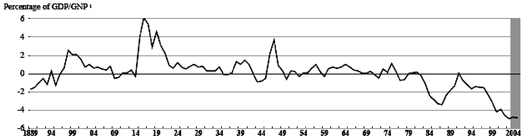
Figure V.1. The US current account in historical perspective